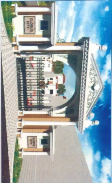
Globus City Chuna bhati